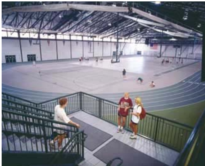
View of the Indoor Track from Second level of Shirk Center

A detailed schedule will be printed after all entries have been submitted